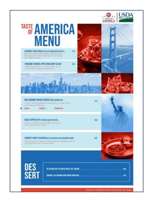
Figure 1. Social Ltd. Taste of America Menu

The blending of culinary traditions from different regions to create innovative dishes has gained popularity worldwide, especially over the last decade. With its diverse set of cultures and cuisines, India is a hotbed for the "fusion food" global trend.<sup>1</sup> India's fusion food interests gained momentum in the 1990s when trade and travel to and from India significantly increased, and Indian chefs began to explore creative dishes to showcase to a growing consumer base.<sup>2</sup> More recently, with India's increased bilateral agricultural trade and exposure to western cultures, local consumers have increased their demand for U.S. food products, including vegetarian and plant-based foods to adopt healthy eating habits. Contemporary fusion foods, which incorporate distinct "western" ingredients into Indian cuisines, represent a growing trend. Recently, Indian chefs have expanded their offerings by creating fusion barbeque dishes, mithai (sweets), and other savory foods. To align with this trend, the campaign focused on the wide range of American food ingredients for sale that can be used in preparing traditional Indian dishes.